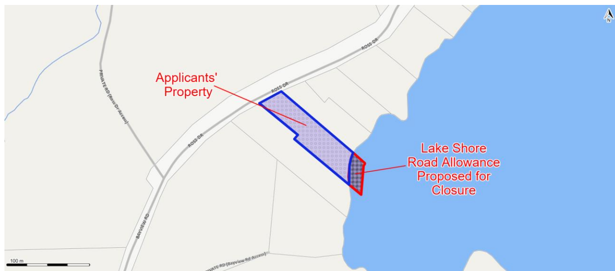
Figure 1: Map of Subject Road Allowance