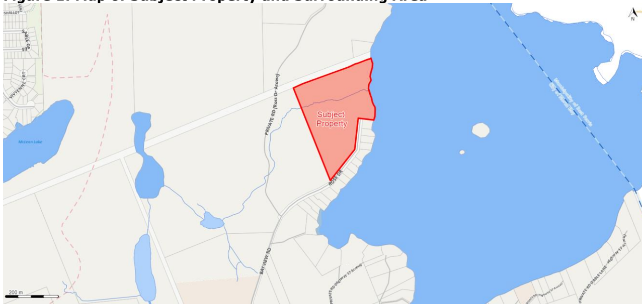
Figure 1: Map of Subject Property and Surrounding Area

The property has an existing lot area of 10.38 hectares and has irregular lot frontage along Trout Lake, as shown on attached Schedule B. The property is currently vacant.