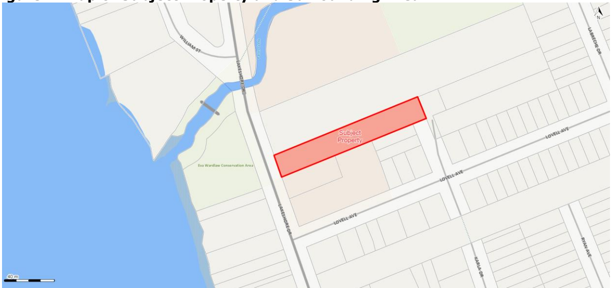
Figure 1: Map of Subject Property and Surrounding Area

The property has an existing lot area of 0.3ha and lot frontage of 21.37m on Lakeshore Drive, as shown on attached Schedule B .