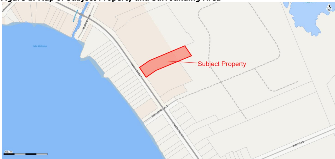
Figure 1: Map of Subject Property and Surrounding Area

The property has an existing lot frontage of 30.1 metres and a total lot area of 3,785.7 square metres on Lakeshore Drive. The property is currently developed with motel units, as shown on attached Schedule B.